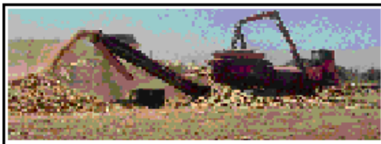
primary grinder in action