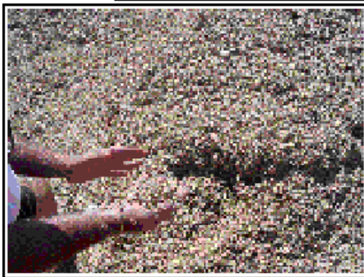
clean, non-toxic, consistent

No toxic or hazardous leachates present.