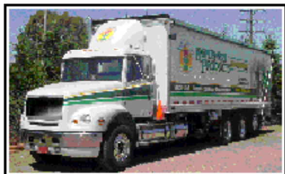
Delivered in clean, modern trucks with installation equipment if requested.

Designer 50/50 blend .....Designer Woodchips blended 50/50 with Forest Mulch.